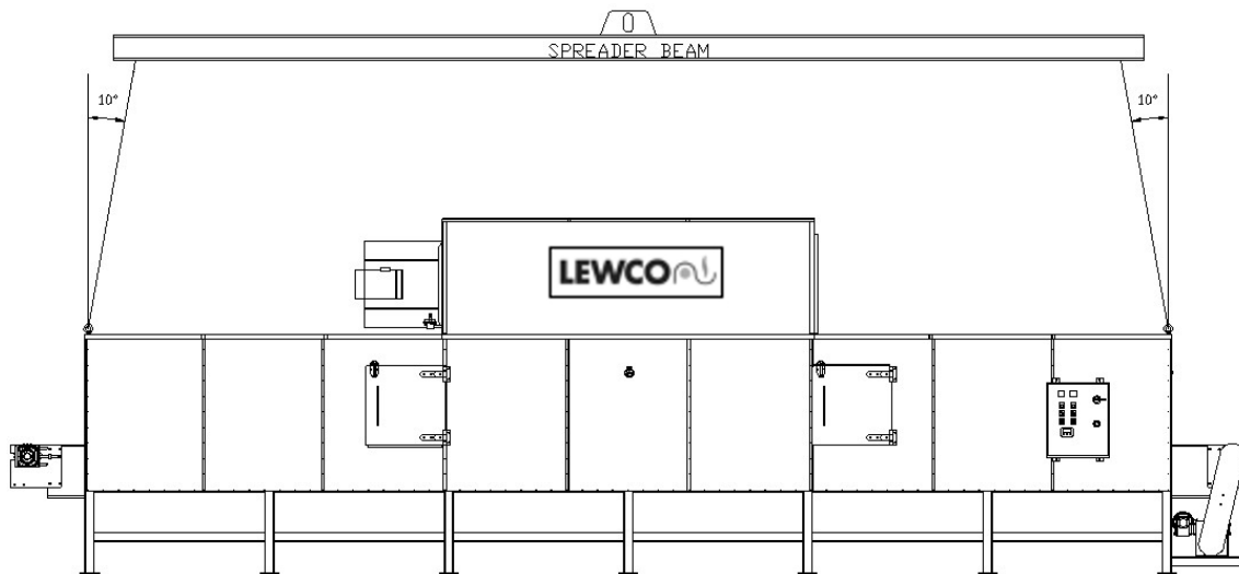
Figure 1: Typical Rigging

Lifting lugs are provided at the top (4) corners of most LEWCO Conveyor Ovens. It is important to note that rigging cables or chains must not exceed a maximum angle of 10 degrees from vertical (see Figure 1 ). Use a spreader beam, or rigging of adequate length to avoid damage to the equipment. Please refer to any assembly drawings for specific assembly and rigging instructions.